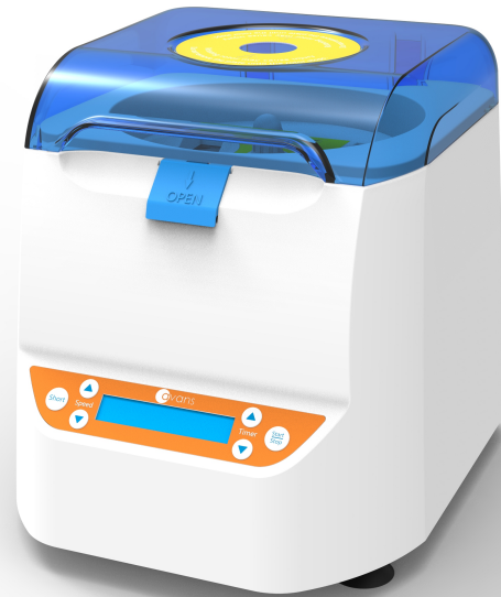
Cat. No. : QF-2228

QuadFuge™ Plate Spinner is the centrifuge designed specifically for quick and easy centrifugation of samples in PCR plates or microplates. Two standard microplates are loaded through a slot in the top of the centrifuge unit. Sealed plates are loaded vertically.